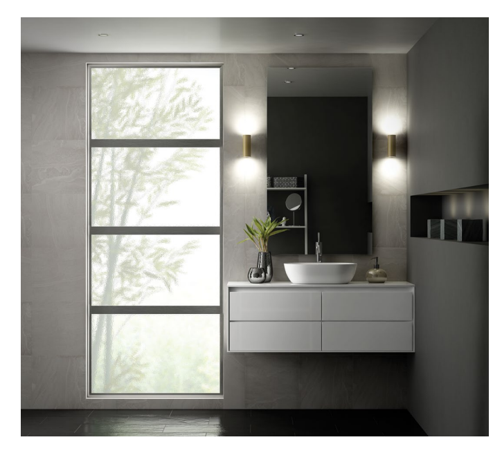
For a bathroom window or windows flanking an entry, look for obscure glass options. These provide privacy without the need for window coverings.