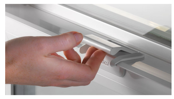
SmartTouch® locks and handles are available in two styles in our V400 Tuscany® and V300 Trinsic™ Series.

Plus, this technology offers peace of mind security at a glance. When the handle is down, the window is locked. When the handle is up, the window is unlocked.