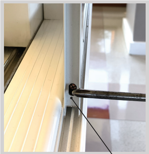
LOCATE BOTTOM SCREW